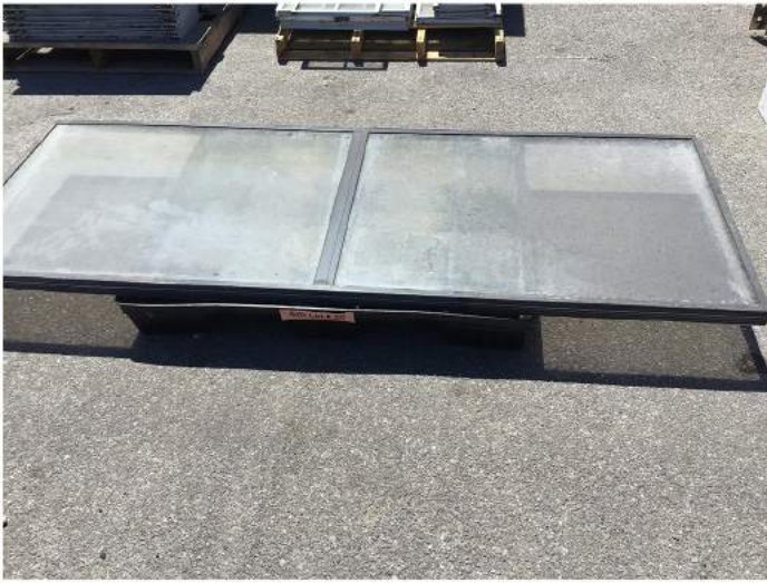
LARGE WINDOW BID #: 308