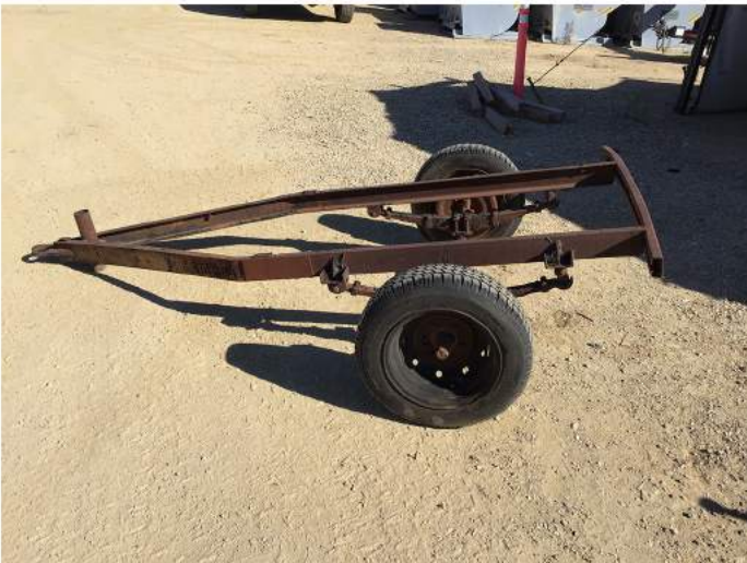
TRAILER BID #: 324