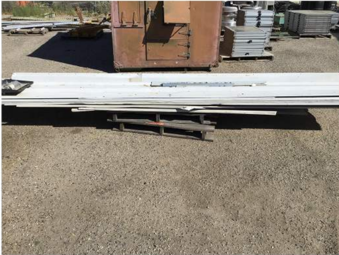
TIN ROOFING/SIDING BID #: 269