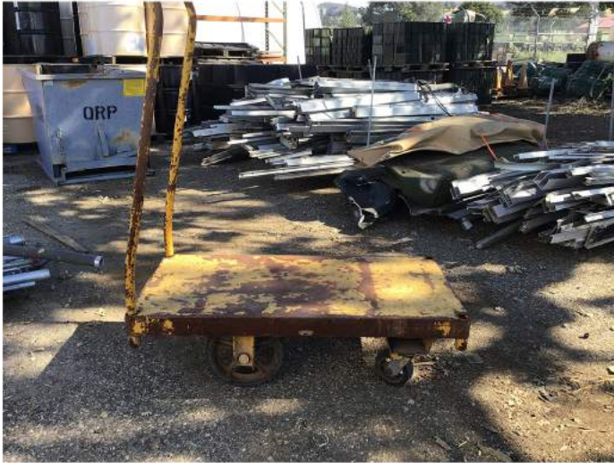
CART BID #: 207