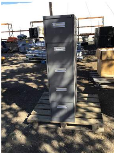
FILING CABINET BID #: 271