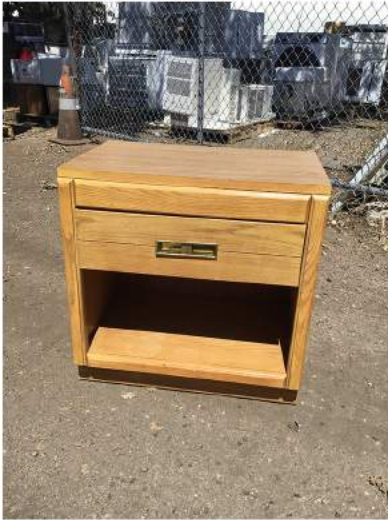
NIGHT STAND PAIR (4 AVAILABLE) BID #: 233, 234, 235, 236