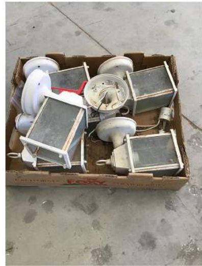
SMALL WALL LIGHTS BID #: 337