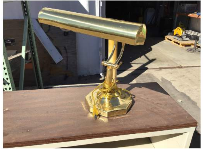
TABLE LAMP BID #: 328