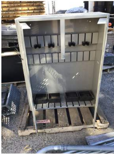
METAL LOCKER ( 2 AVAILABLE) BID #: 275, 276