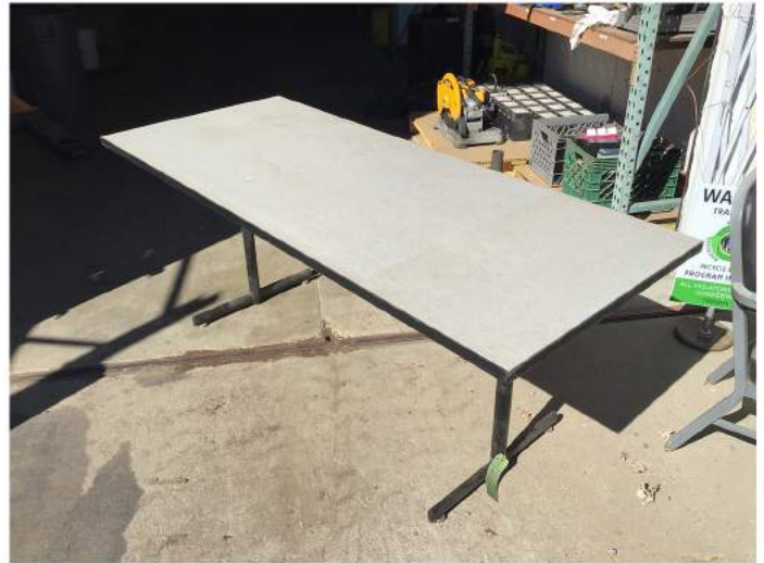
FOLDING TABLE BID #: 330