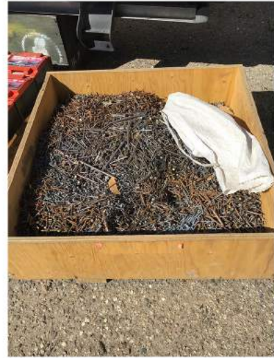
BOX OF MIXED NAILS BID #: 208