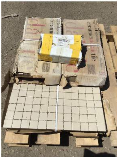
FLOOR TILE - PALLET BID #: 322