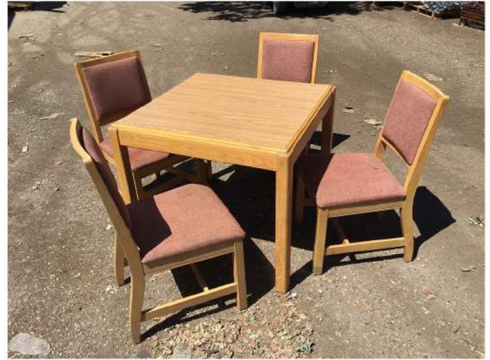
DINETTE SET ( 4 AVAILABLE) BID #: 237, 238, 239, 240