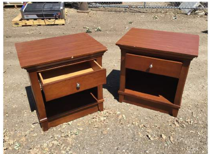
NIGHT STANDS - PAIR BID #: 242