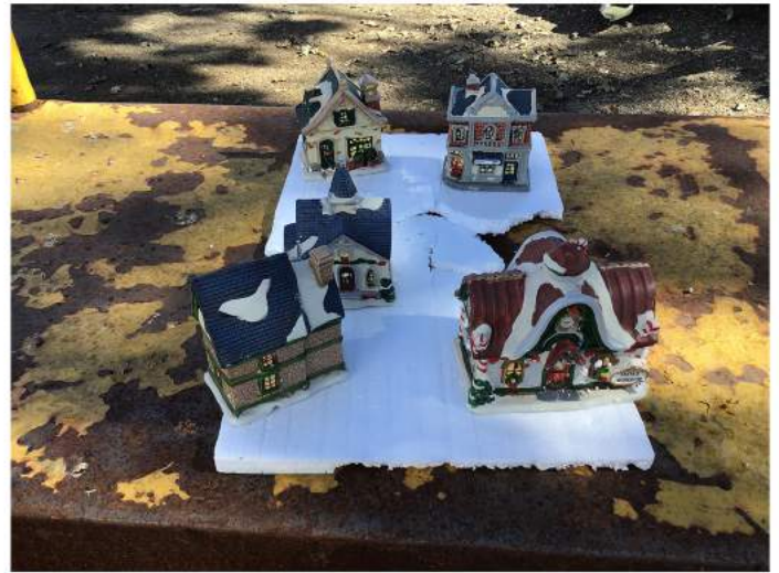
MINI CHRISTMAS VILLAGE BID #: 274