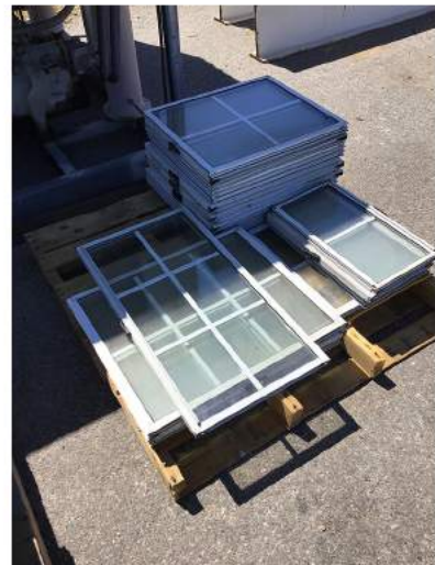
WINDOWS - ASSORTED SIZES BID #: 307