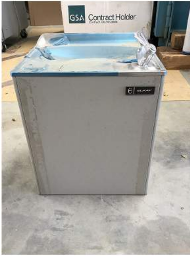
SHORT WATER COOLER ( 2 AVAILABLE) BID #: 287, 288