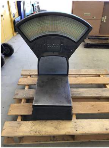
OLD SCALE BID #: 280