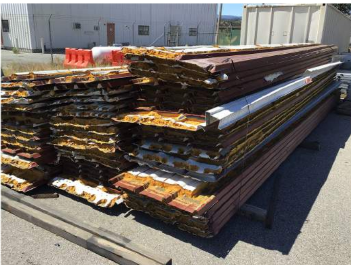
TIN ROOFING BID #: 241