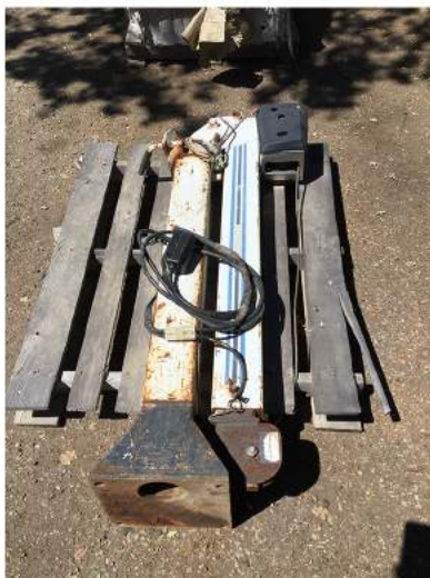
TRUCK MOUNT HOIST BID #: 285