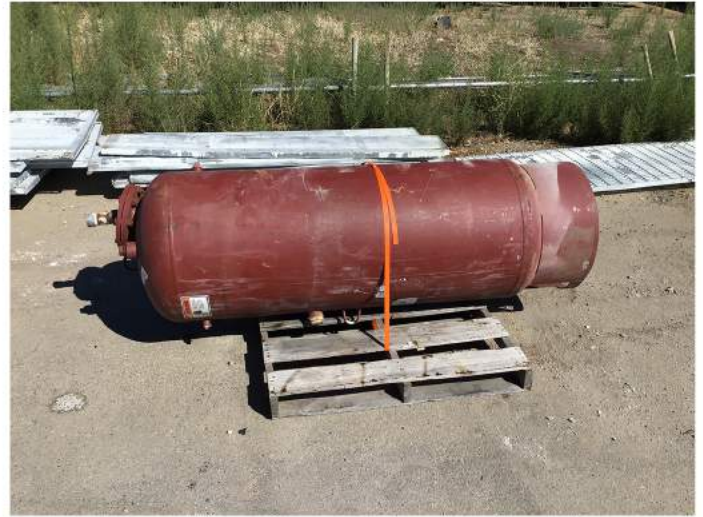
METAL TANK BID #: 335