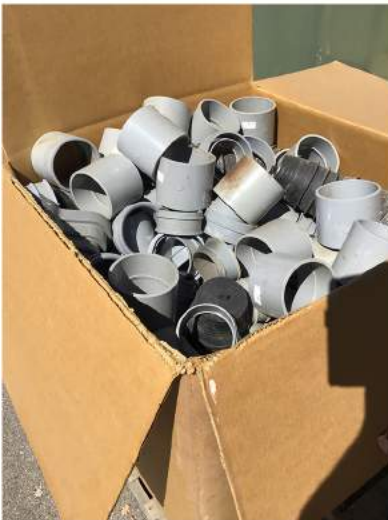
BOX OF PVC COUPLINGS AND OTHER BID #: 338