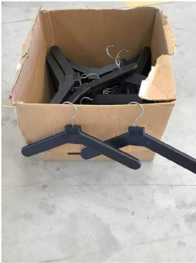
COAT HANGERS BID #: 336