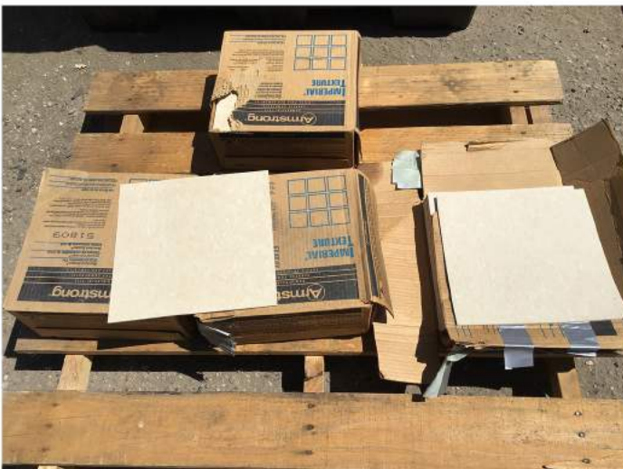
BEIGE VINYL TILE - 4 BOXES BID #: 318