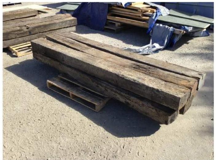
RAILROAD TIES - 6 PER PALLET ( 3 AVAILABLE) BID #: 296, 297, 298