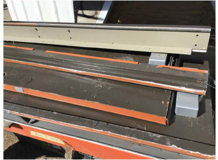
METAL DOORS - 2 BID #: 270