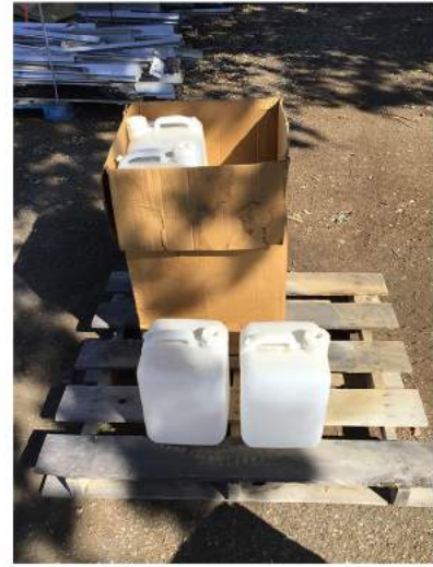
PLASTIC JUGS (8 COUNT) - 2 AVAILABLE BID #: 205, 206