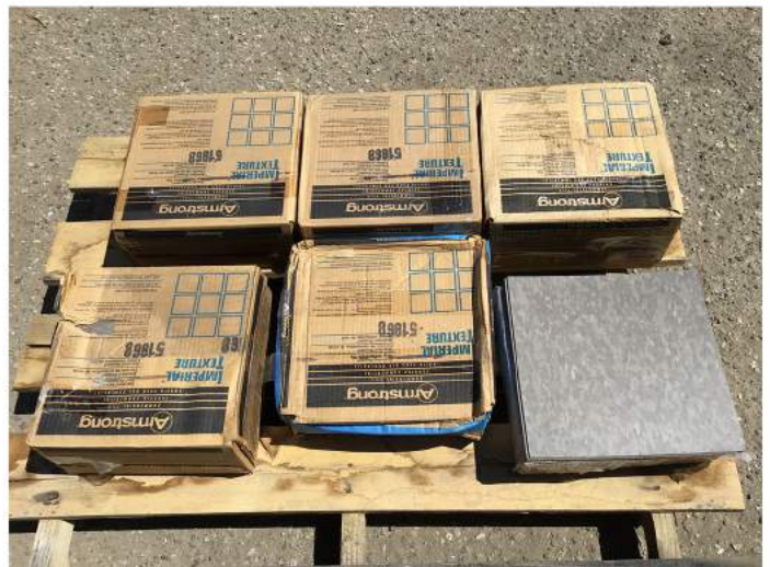
GREY VINYL TILES - 6 BOXES BID #: 319