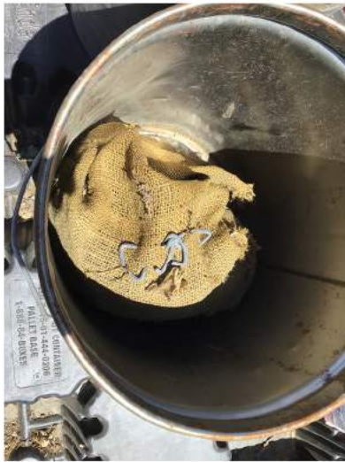
HOG CLIPS BID #: 250