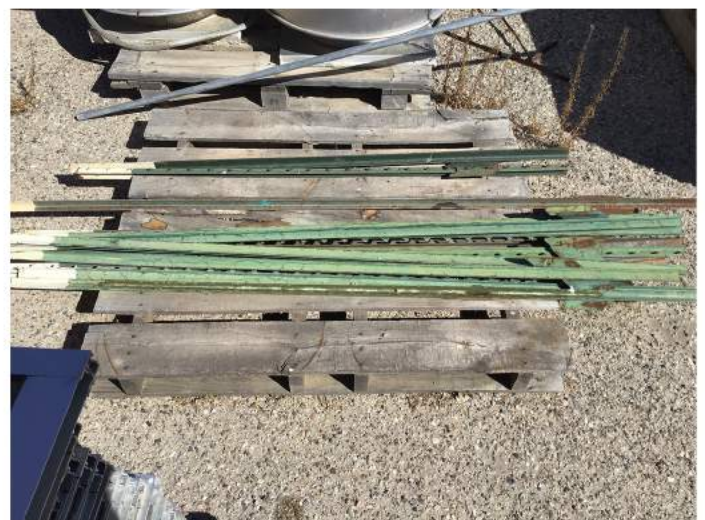
FENCE PICKETS BID #: 279