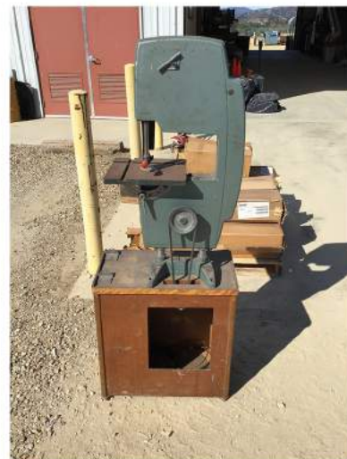
BAND SAW BID #: 203