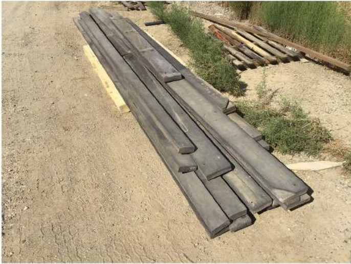
WOOD TRUCK BED SLATS (2 AVAILABLE) BID #: 333, 334