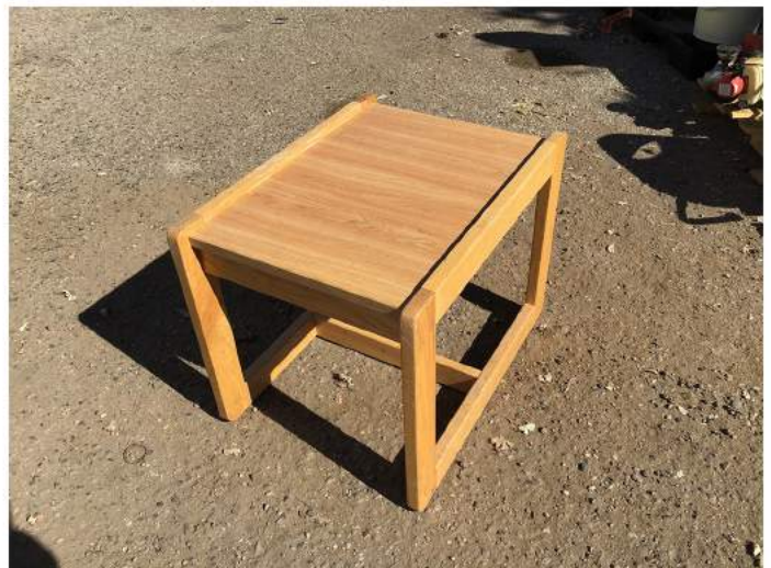
INTABLE BID #: 332