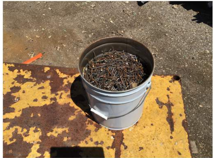
BUCKET OF NAILS ( 3 AVAILABLE) BID #: 247, 248, 249