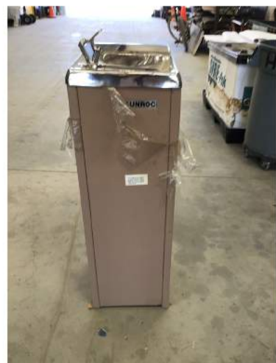
TALL WATER COOLER BID #: 286