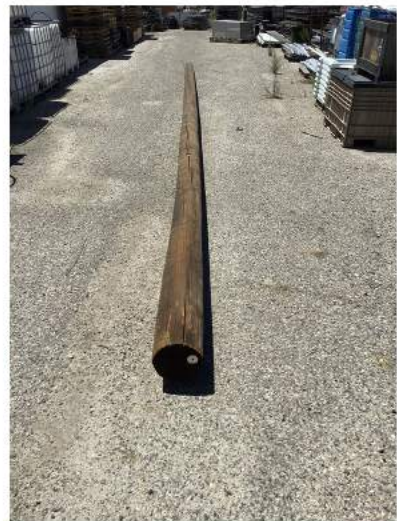
POWER POLE BID #: 313