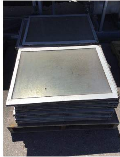
WINDOWS - 24 (2 AVAILABLE) BID #: 304, 305