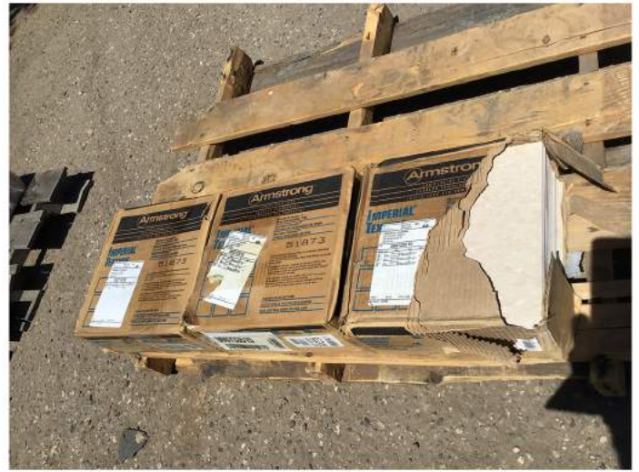
BEIGE VINYL TILE - 3 BOXES BID #: 315