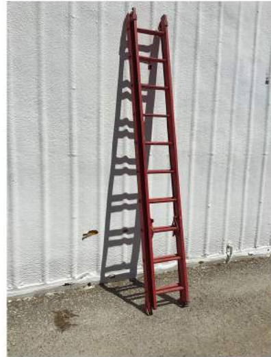
EXTENSION LADDER - 10FT BID #: 284