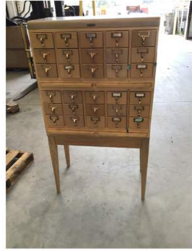
LIBRARY CARD FILE BID #: 302