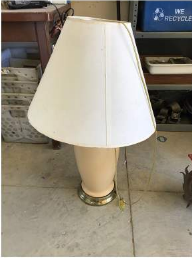
LAMP BID #: 267