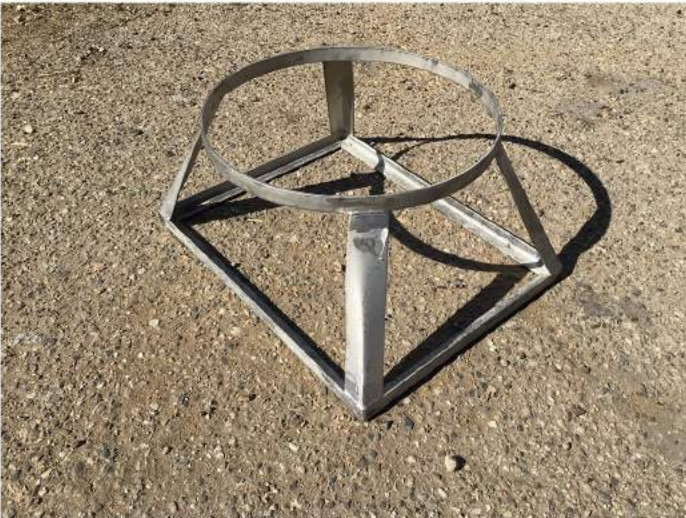
METAL STAND BID #: 329