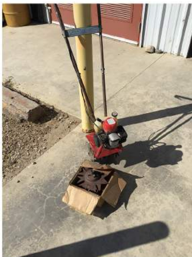
SMALL TILLER BID #: 202