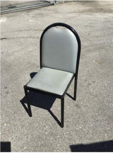
CHAIRS - PALLET OF 4 (4 AVAILABLE) BID #: 224, 225, 226, 227