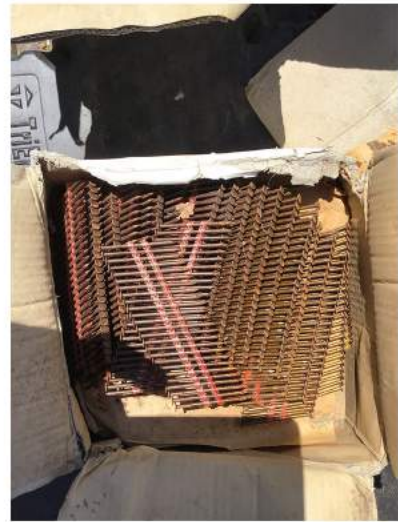
BOX OF NAILS ( 2 AVAILABLE) BID #: 251, 252