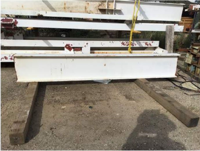
I BEAM - 6 1/2 "X18"X118"X 5/8 " BID #: 290