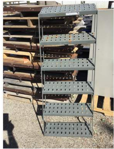
METAL STAIRS BID #: 277