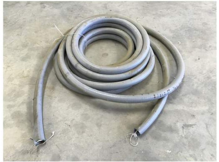
ELECTRICAL FLEX CONDUIT BID #: 289