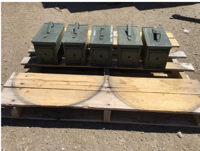
INDIVIDUAL AMMO CANS BID #: 312