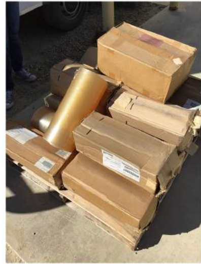
STRETCH WRAP - PALLET BID #: 268