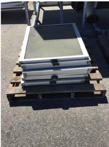
WINDOWS - 12 BID #: 306