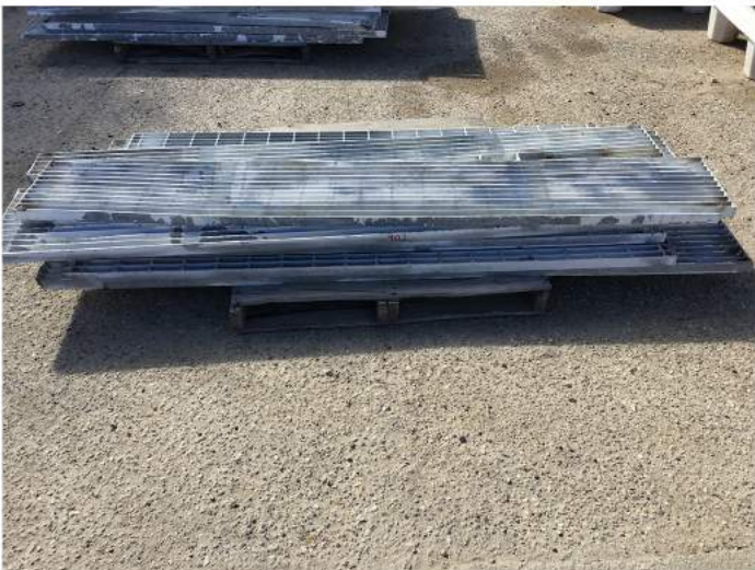
CATWALK (4 AVAILABLE) BID #: 292, 293, 294, 295