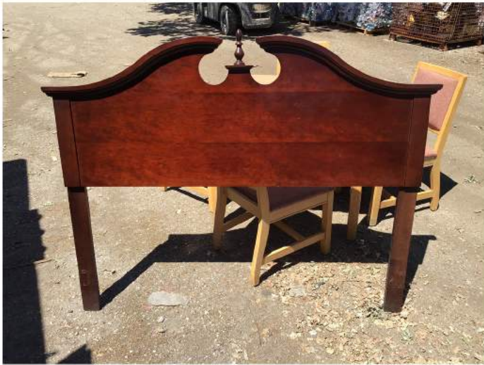
HEADBOARD ( 4 AVAILABLE) BID #: 243, 244, 245, 246