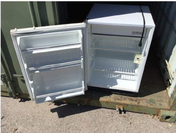
SMALL REFRIGERATOR (10 AVAILABLE) BID #: 209, 210, 211, 212, 213, 214, 215, 216, 217, 218