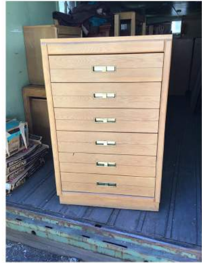
CHEST WITH DRAWERS (5 AVAILABLE) BID #: 228, 229, 230, 231, 232