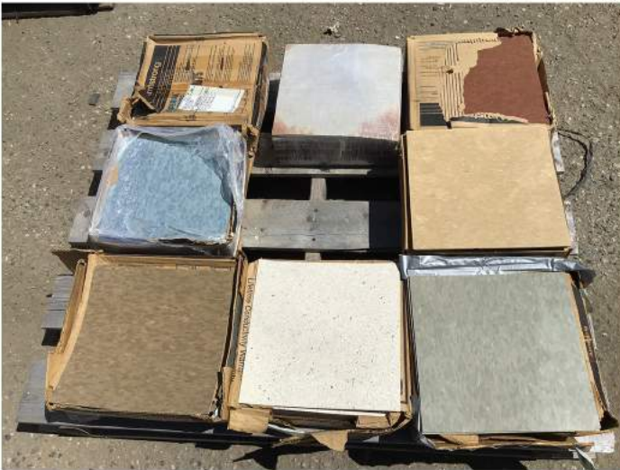
ASSORTED VINLY TILE - PALLET BID #: 316