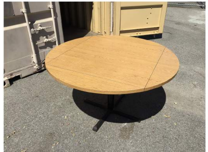
ROUND TABLE / FOLDING SIDES (5 AVAILABLE) BID #: 219, 220, 221, 222, 223