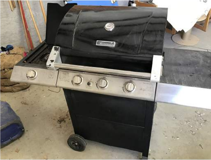
KENMORE BBQ BID #: 303