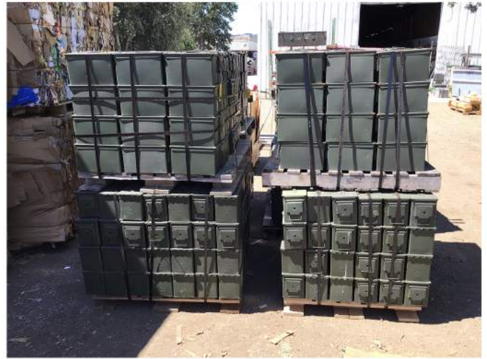
AMMO CANS BY THE PALLET BID #: 311