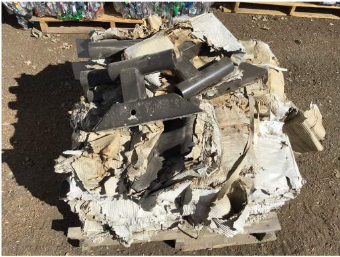
LIGHT HOLDERS - PALLET BID #: 273