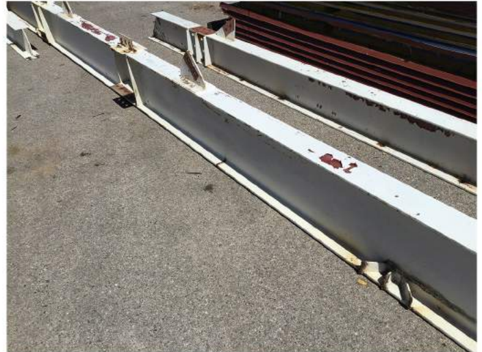
I BEAM - 6 1/2 "X12"X20'X 1/2 " BID #: 321