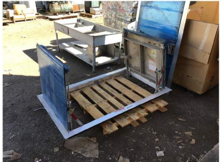
SPRING LOADED HATCH DOORS (2 AVAILABLE) BID #: 325, 326