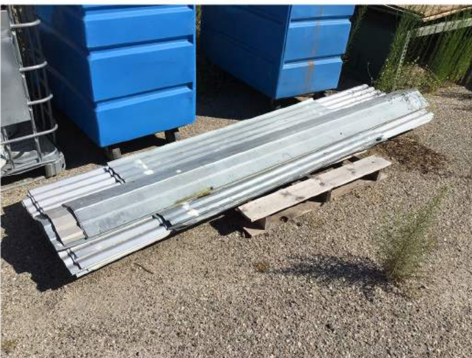
CORRIGATED TIN BID #: 278