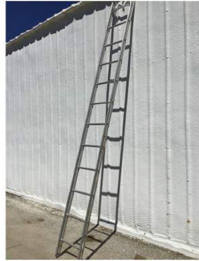
ROOF LADDER - 14FT ( 2 AVAILABLE) BID #: 281, 282