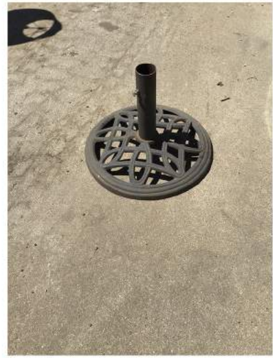
UMBRELLA STAND BID #: 309