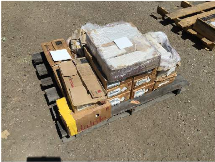
WHITE TILE - PALLET BID #: 314