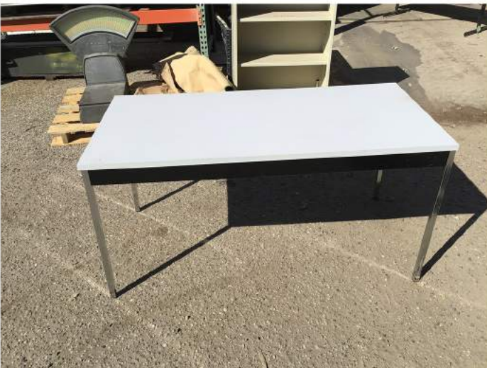
FIXED LEG TABLE BID #: 331