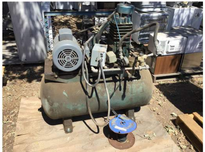
AIR COMPRESSOR BID #: 339