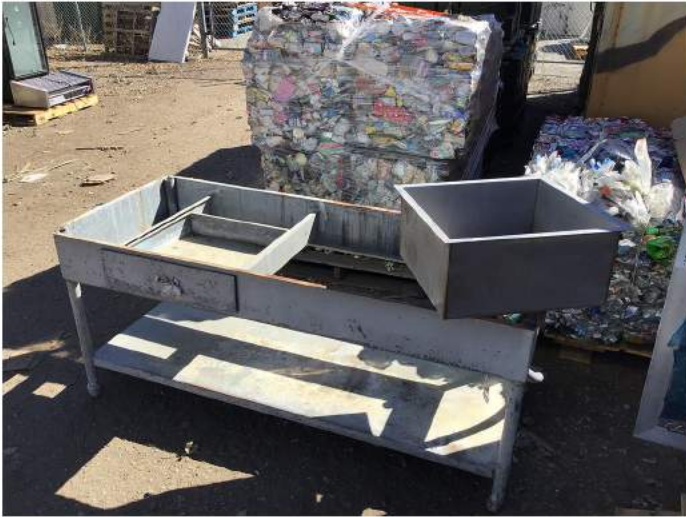
METAL FRAME WITH DRAWER AND SINK BID #: 327