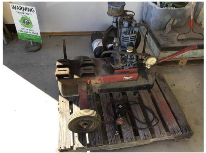
AIR COMPRESSOR WITH NO MOTOR BID #: 323