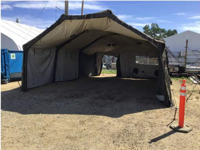
TENT (10 AVAILABLE) BID #: 200A, 200B, 200C, 200D, 200E, 200F, 200G, 200H, 200I, 200J

Disclaimer: All items are sold as is and are considered scrap. You can call-in your bid the day of the auction by calling (831) 682-0088.