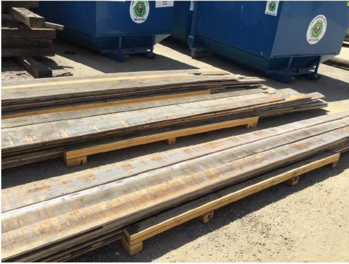
LUMBER - ASSORTED SIZES ( 3 AVAILABLE) BID #: 299, 300, 301