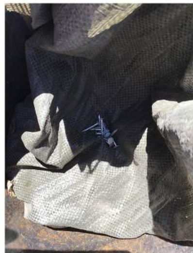
BOX OF ROOFING NAILS BID #: 260