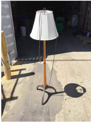
FLOOR LAMP BID #: 310