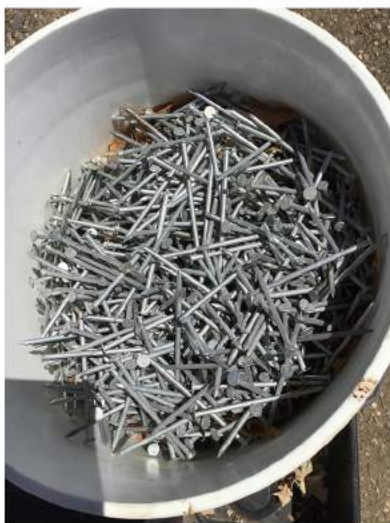
BUCKET OF NAILS ( 7 AVAILABLE) BID #: 253, 254, 255, 256, 257, 258, 259