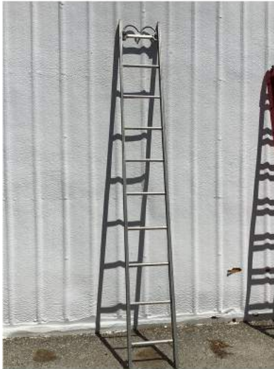
FOUR LADDER - 12FT BID #: 283