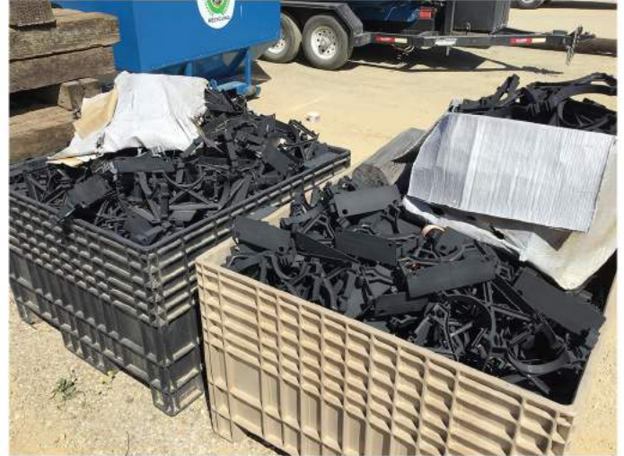
CONDUIT SUPPORT - 2 BOXES BID #: 201