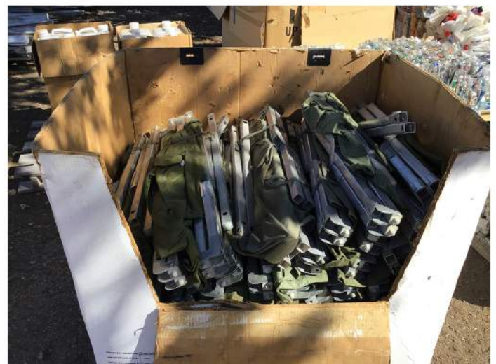
COTS - BOX BID #: 272