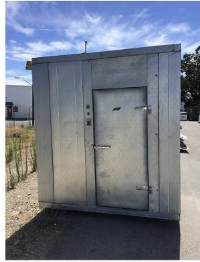
WALK-IN COOLER - 8X8 BID #: 291