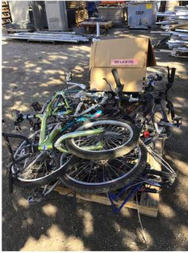
BICYCLES - 1 PALLET BID #: 204